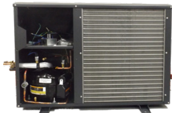
DS025, DSo50, DSo88, WGS40, WGS75, WGS100 Condensing unit with easy-access cover

*Condensing unit is patented US Patent No. D791294 EU Patent No. 003189349-0001