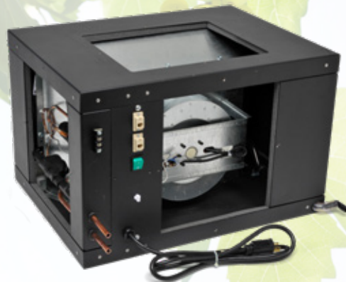
Removable cover panel for easy access