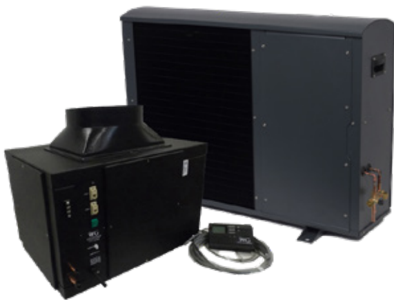
Wine Guardian Evaporator (L) and condensing unit (R) (DS025, DSo50, DSo88, WGS40, WGS75, WGS100 only)