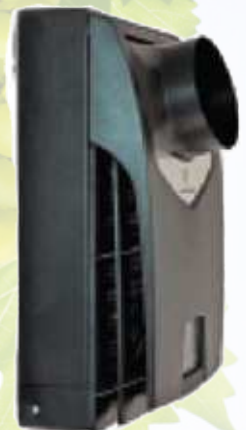
Back View With Optional Duct Adapter