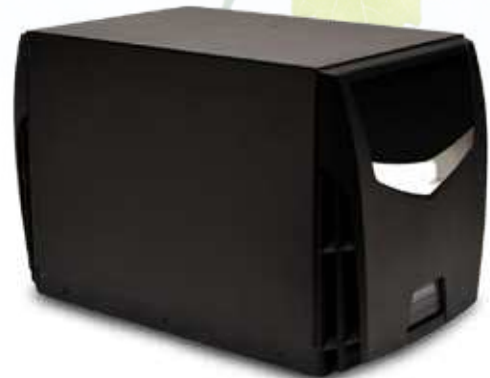
TTW unit out of racking