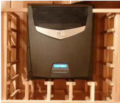
Front View in Racking