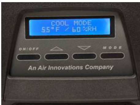
Front Digital Display